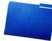
Office paper & file folders