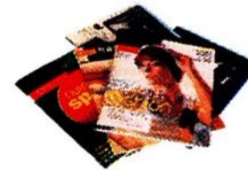
Magazines & catalogs