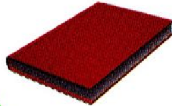
Books (hard or paperback)