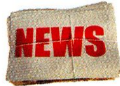
Newspaper & inserts