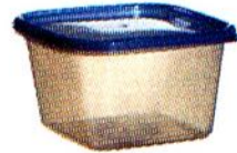
Plastic tubs, jars, & trays Plastic #1 - #7